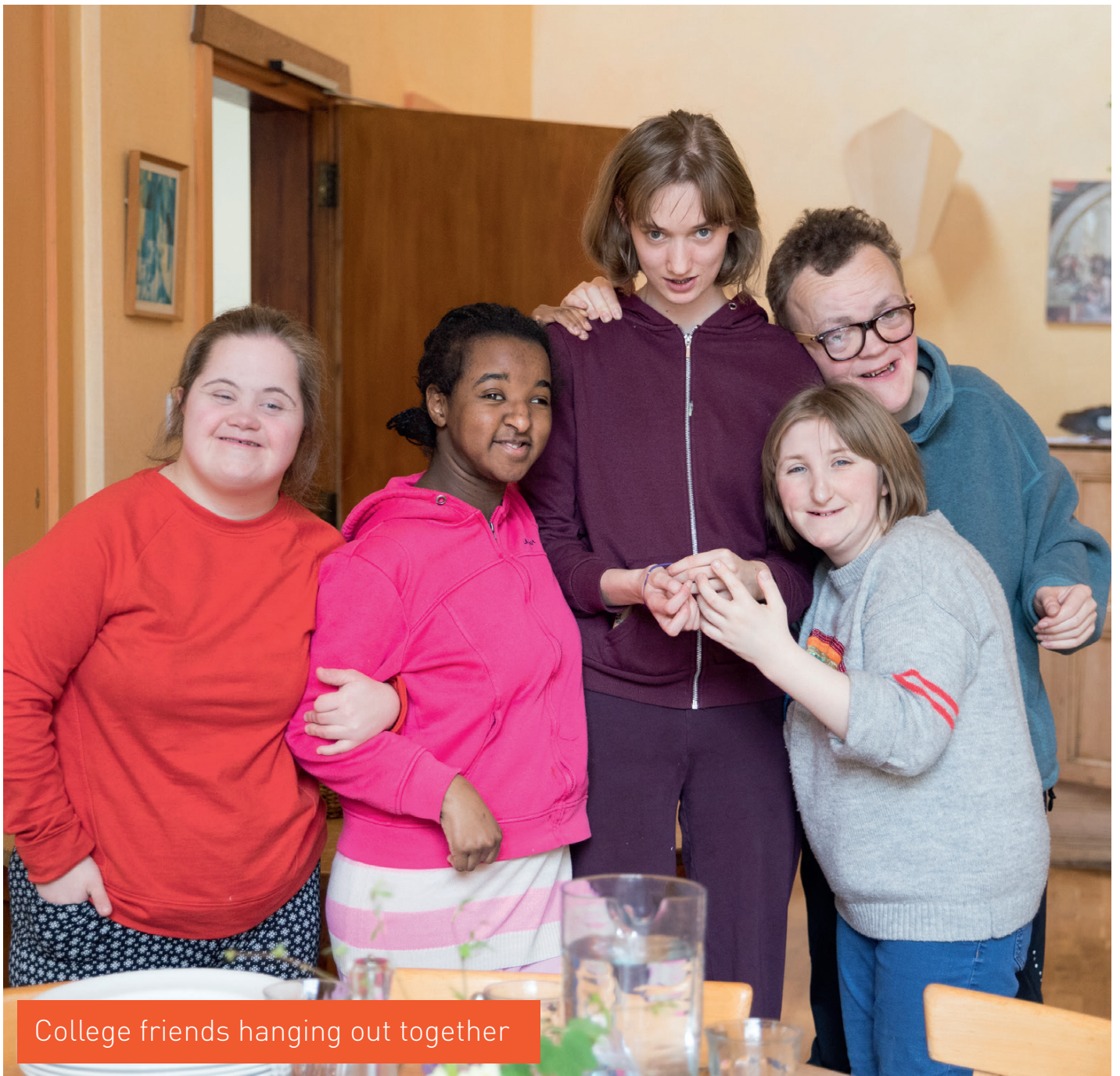
College friends hanging out together

We ask for your support to help us provide vulnerable young people a fulfilled, meaningful home, work and college life with us here at The Mount.