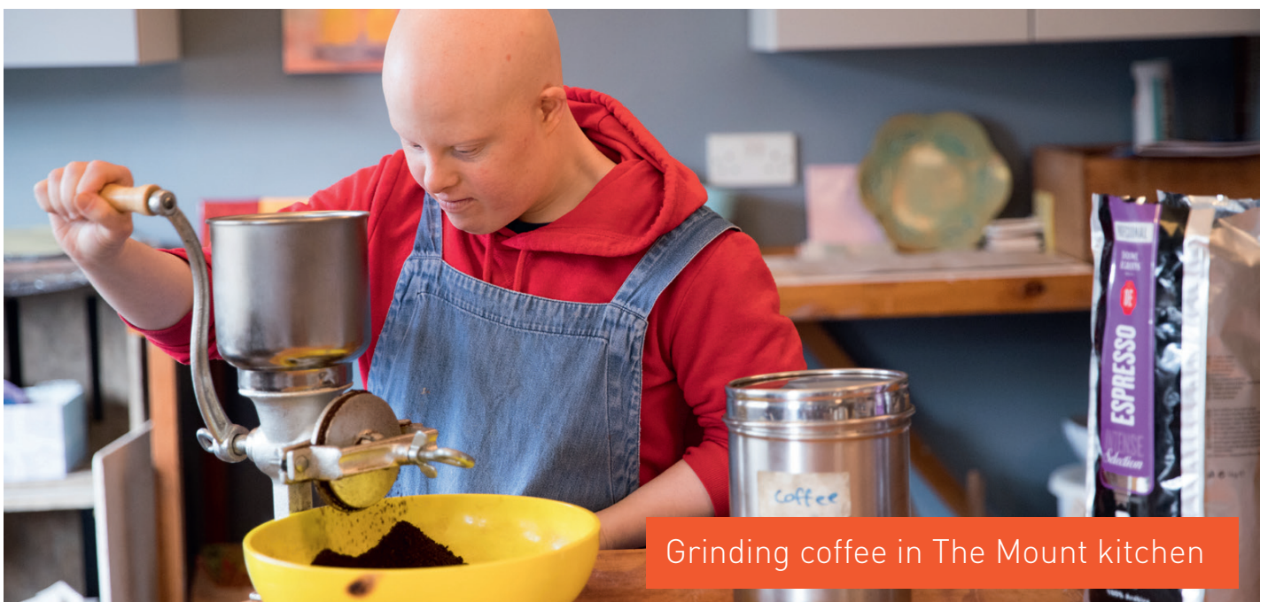
Grinding coffee in The Mount kitchen