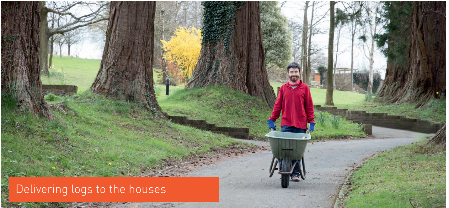
Delivering logs to the houses

We strive to provide the fullest possible life for those who stay with us. Core educational, housing and support costs are met through local authority funding. But the personalised, enriched experience we hope to offer is only possible through the funding we receive from voluntary donations and fundraising.